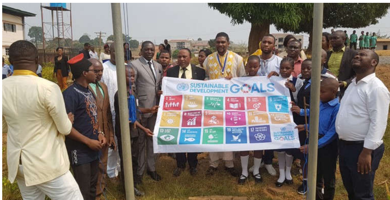
Hosting of SDG flag / inauguration of the CAMYOSFOP Human Rights, Peace and SDG Club, CCSS, Nkolbong, Yaounde

Cameroon Youths and Students Forum for Peace (CAMYOSFOP)