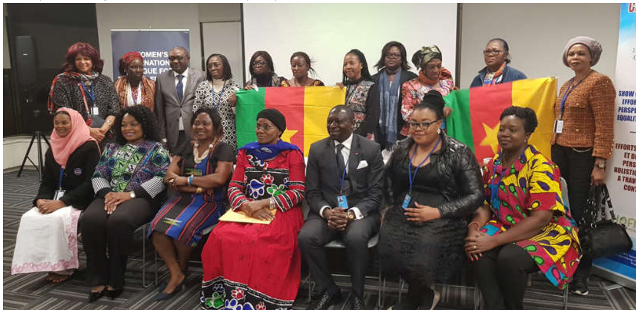
Family picture at the end of the event with the Minister of Women Empowerment in red flanked by the participants